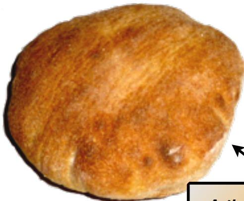
Artisan Dinner Roll